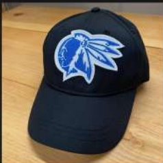
Cotton Hat with Embroidery patch