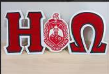
Chenille and Embroidery Patches