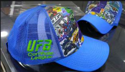
Trucker Hat with Sublimation