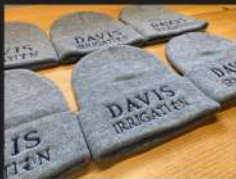
Beanie with embroidery